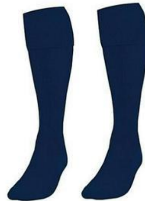
Navy Blue Socks